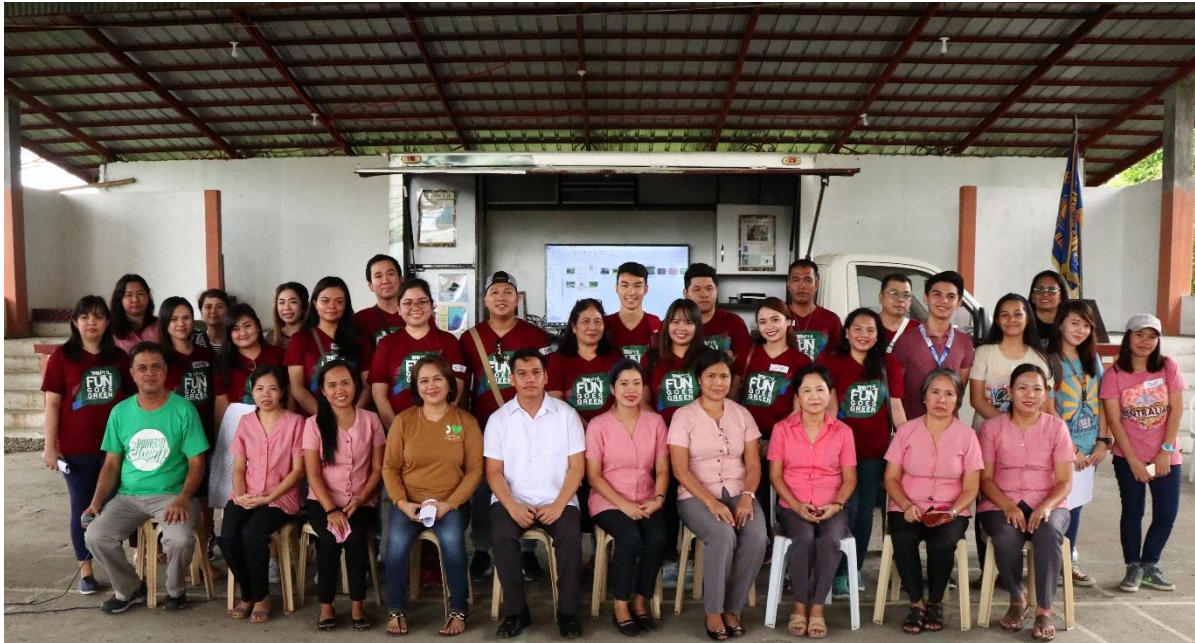
BOW Activity (Day 1): CSR participants during the implementation of the Biodiversity on Wheels (BOW) Activity at the Leganes National High School, Leganes, Iloilo.