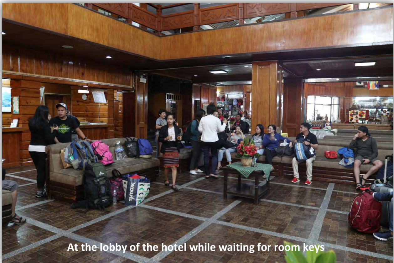
Dinner at 7 th Heaven Café, 15 July 2018