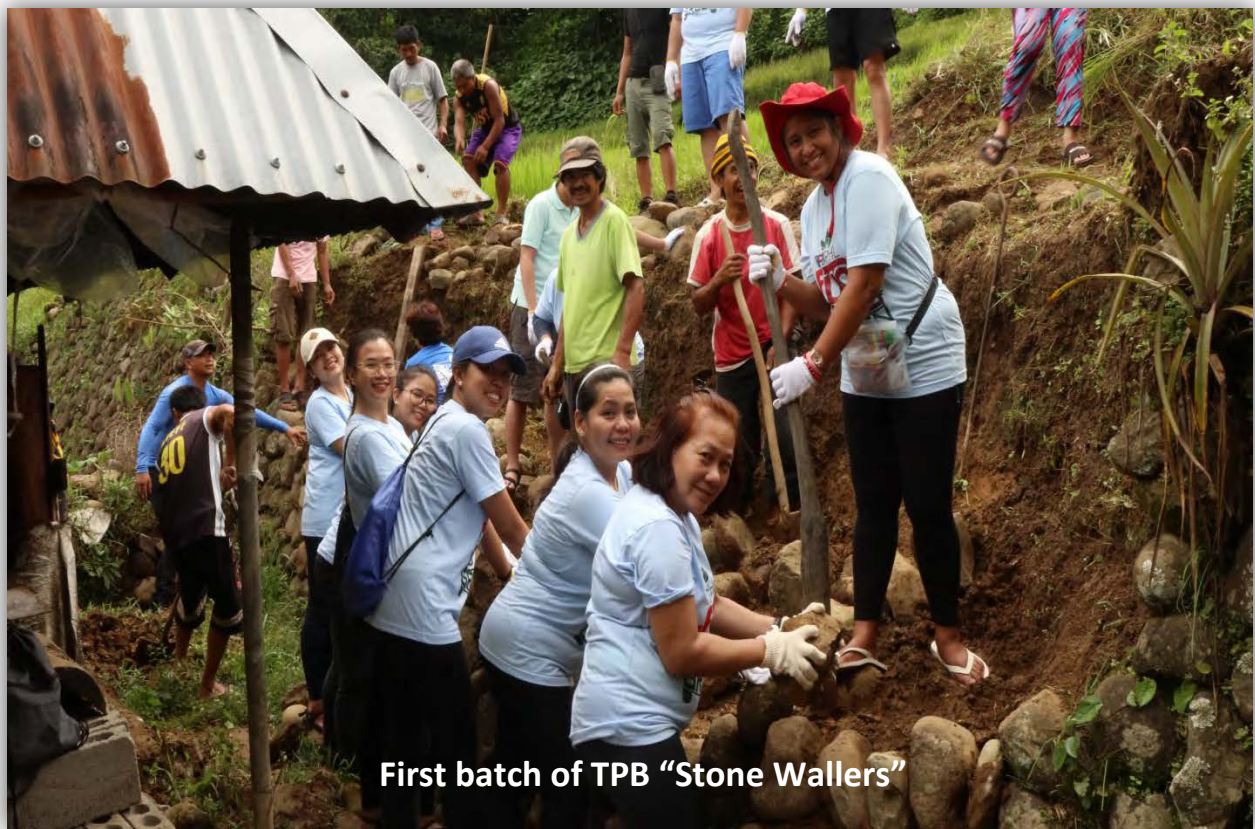
First batch of TPB "Stone Wallers"