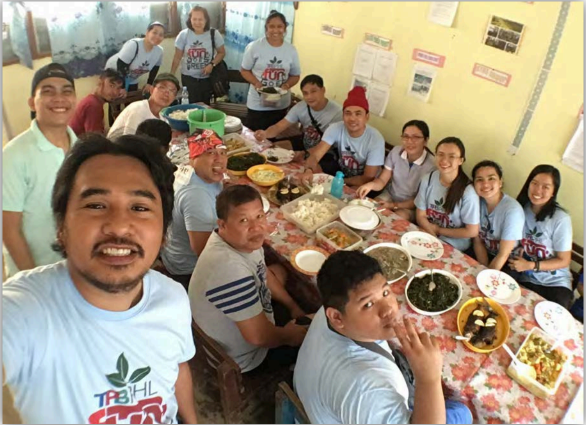
Stone walling near Cambulo Elementary School