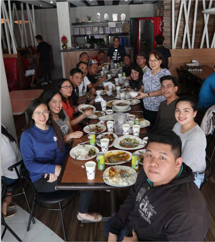
Lunch at Bread N' Bites Restaurant, Solano, Nueva Vizcaya 15 July 2018