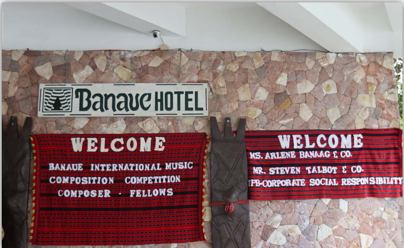
Arrival at Banaue Hotel and Youth Hostel