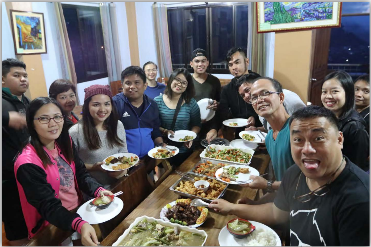
Depart from Banaue Hotel to Cambulo Village via Top-load Jeepney