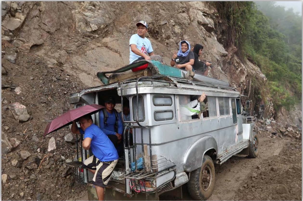
Jump-off point and Trek to Cambulo Village