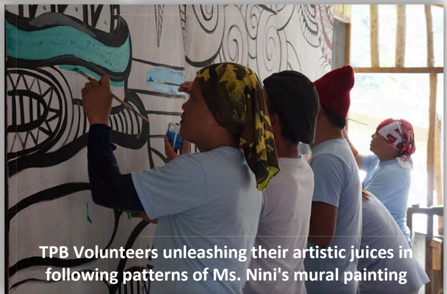
TPB Volunteers unleashing their artistic juices in following patterns of Ms. Nini's mural painting