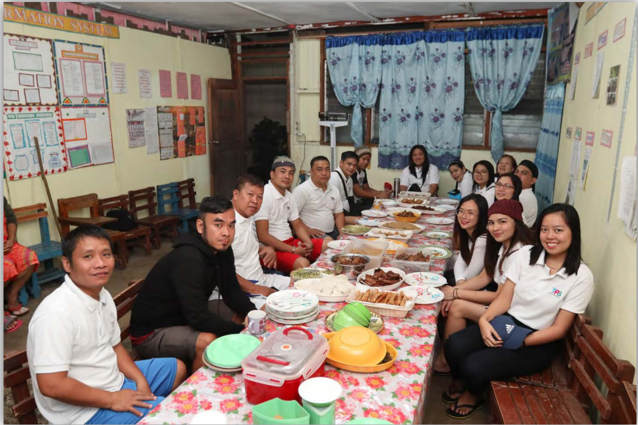
Cultural Night with Cambulo Officials and Elders