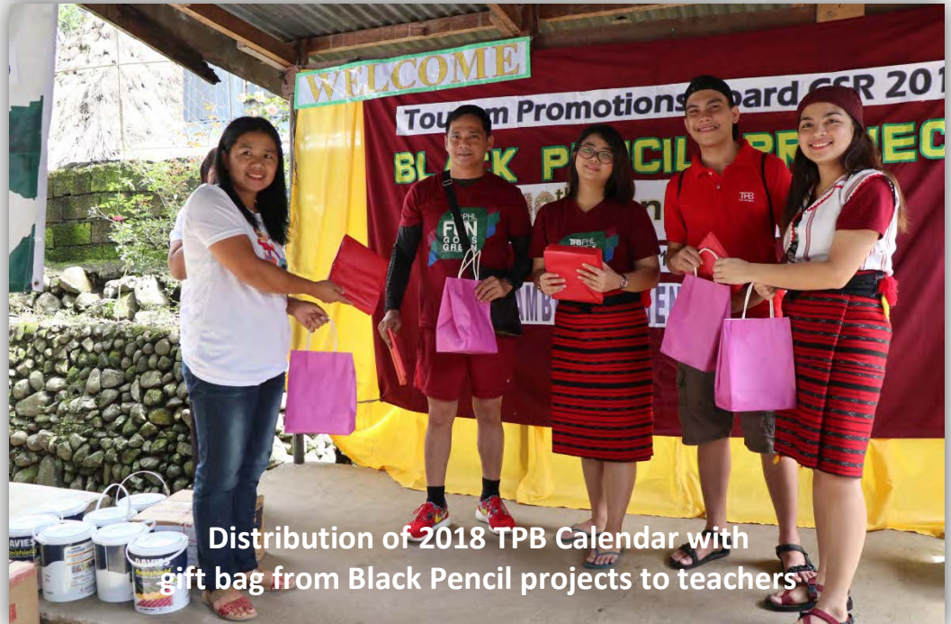
Distribution of 2018 TPB Calendar with gift bag from Black Pencil projects to teachers