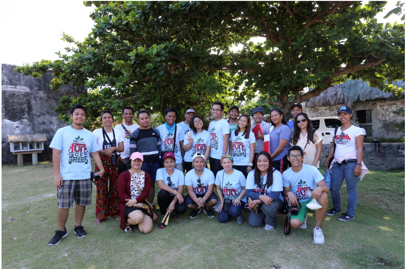
Brief tour after distribution of school supplies, 18 May 2018