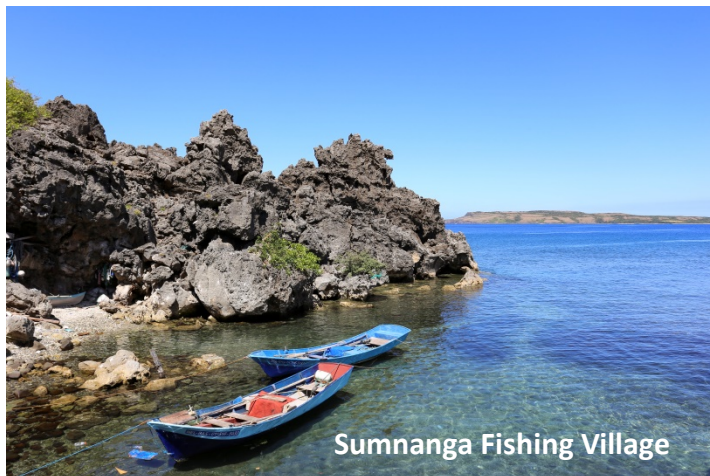
Sumnanga Fishing Village