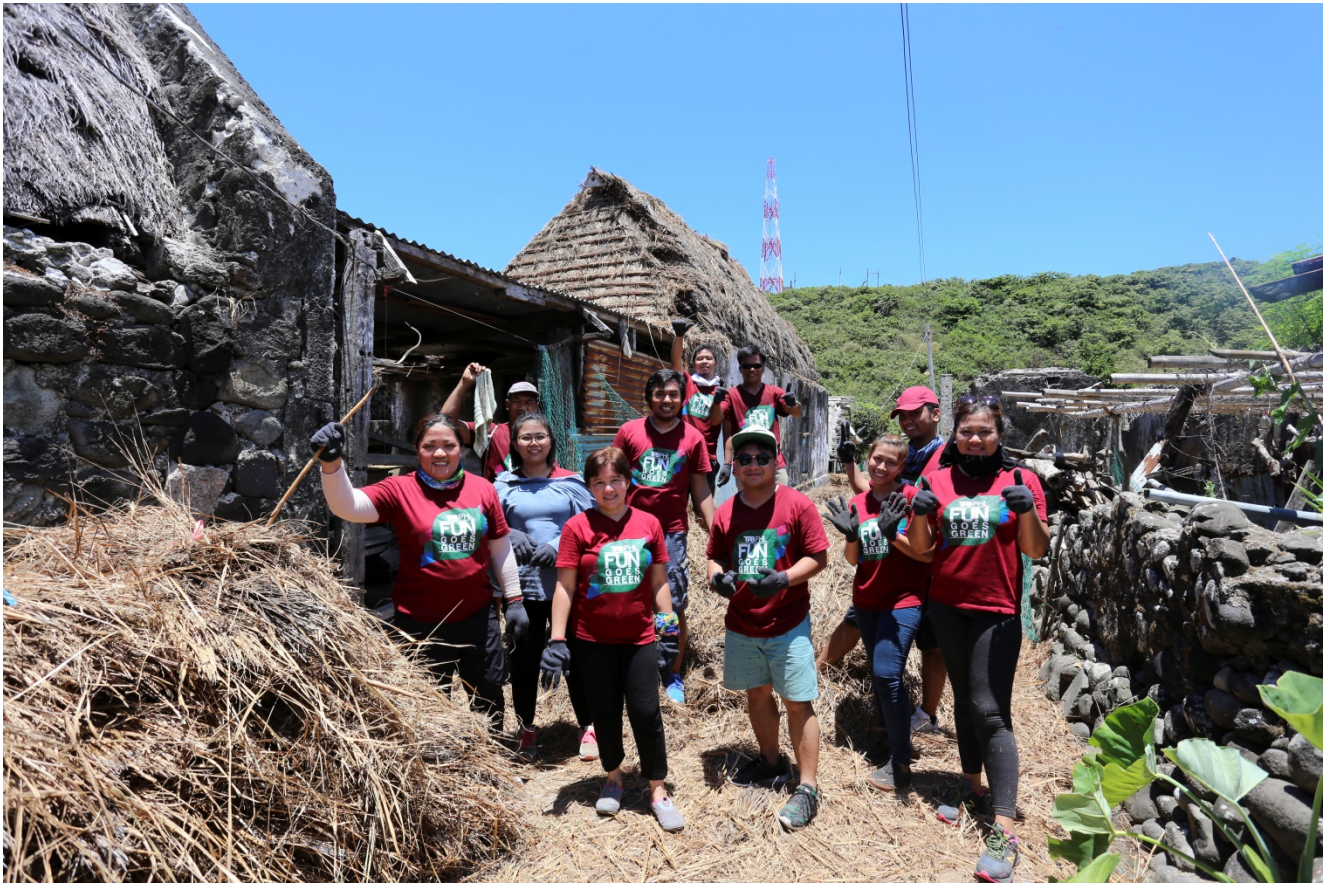
Brief tour around Basco before heading back to Manila, 19 May 2018