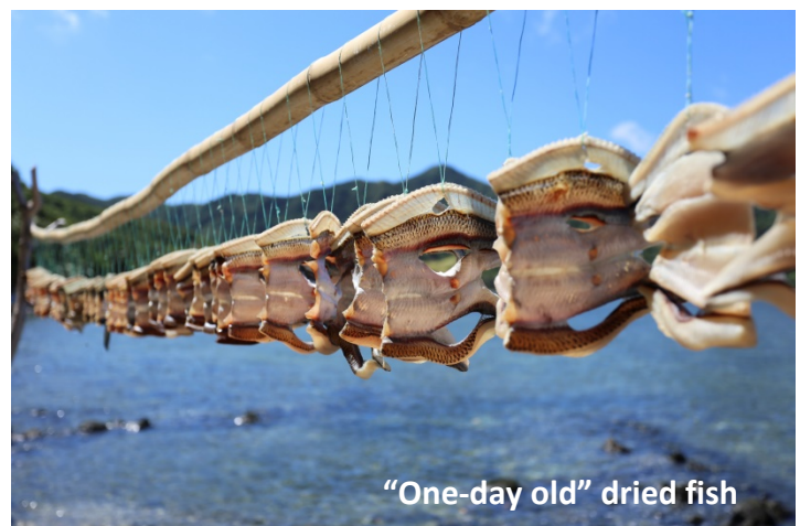
"One-day old" dried fish