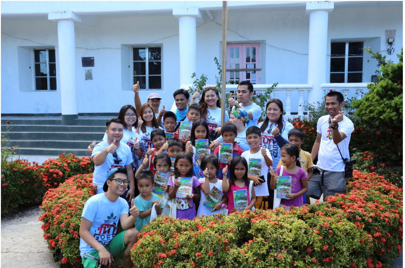
Brief Tour and Photo Opportunity around Sabtang, Batanes, 18 May 2018