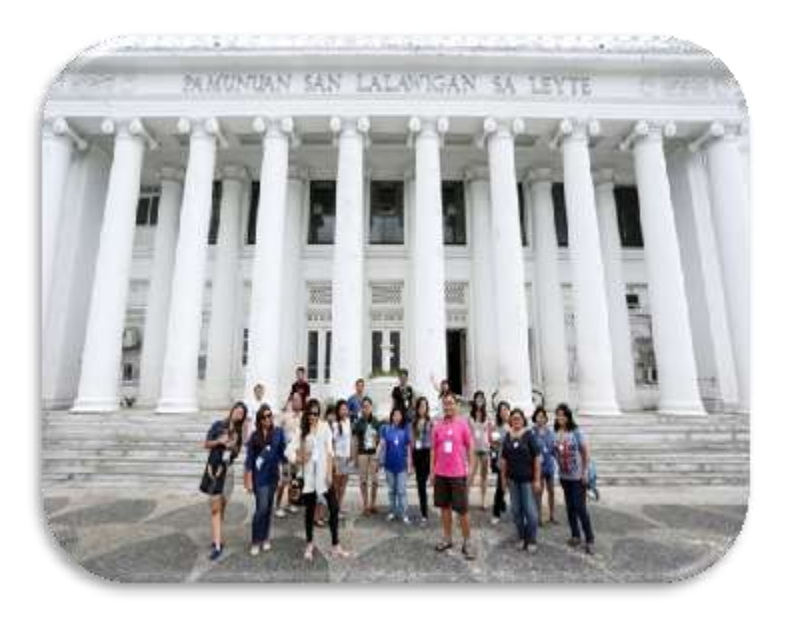
TPB CSR Participants at Leyte Provincial Capitol.