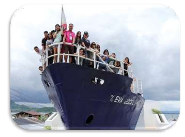
TPB CSR Participants at MV Eva Jocelyn Shrine, part of the ship that ran aground during the fateful day of typhoon Yolanda.