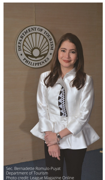
Sec. Bernadette Romulo-Puyat Department of Tourism

Read more: http://www.tourism.gov.ph/news_features/roomsreservedforofwsquarantine.aspx