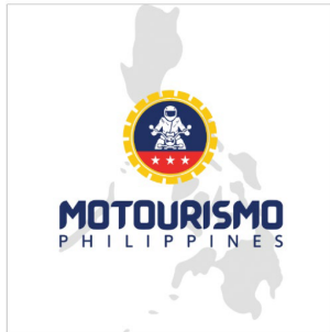
STICKER ON WHITE BACKGROUND (15cm x 15cm) & (8cm x 8cm)