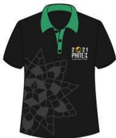
Uniform 1 (Polo Shirt): Parol Design (with Colored PHITEX 2021 Logo)