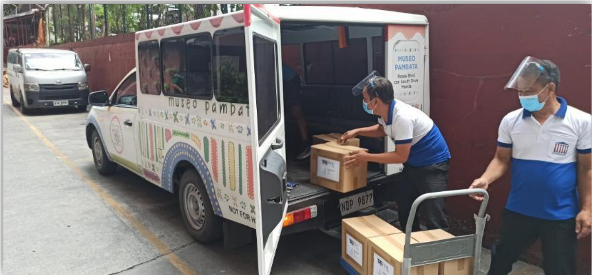
In Photos: Loading of the promo materials to Museo Pambata's vehicle