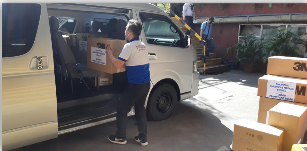
In Photos: Loading of the promo materials to TPB's vehicle