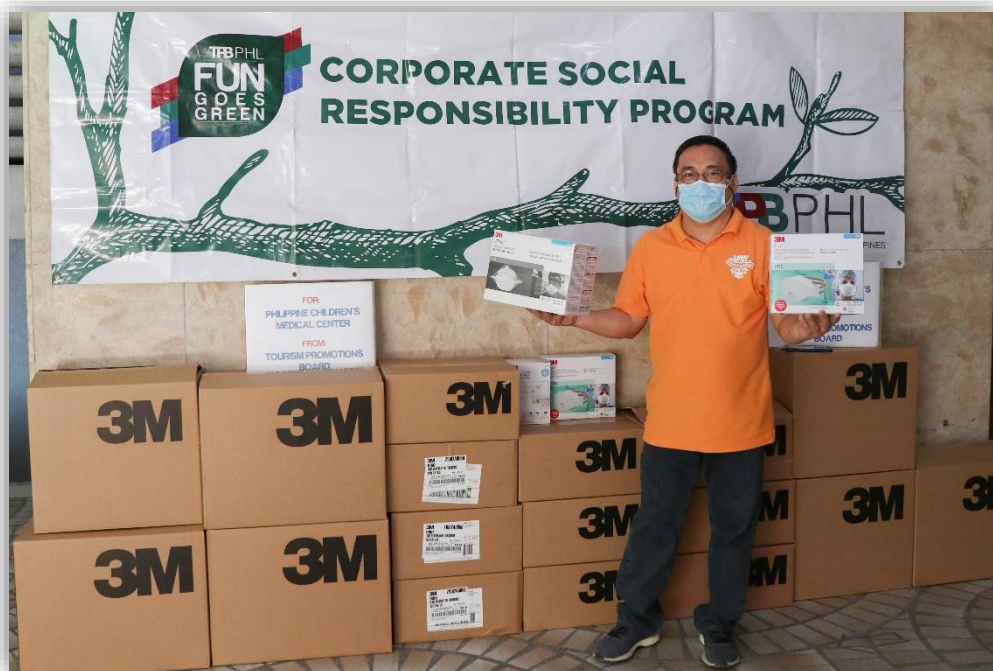
In Photos: TPB's donations to PCMC.