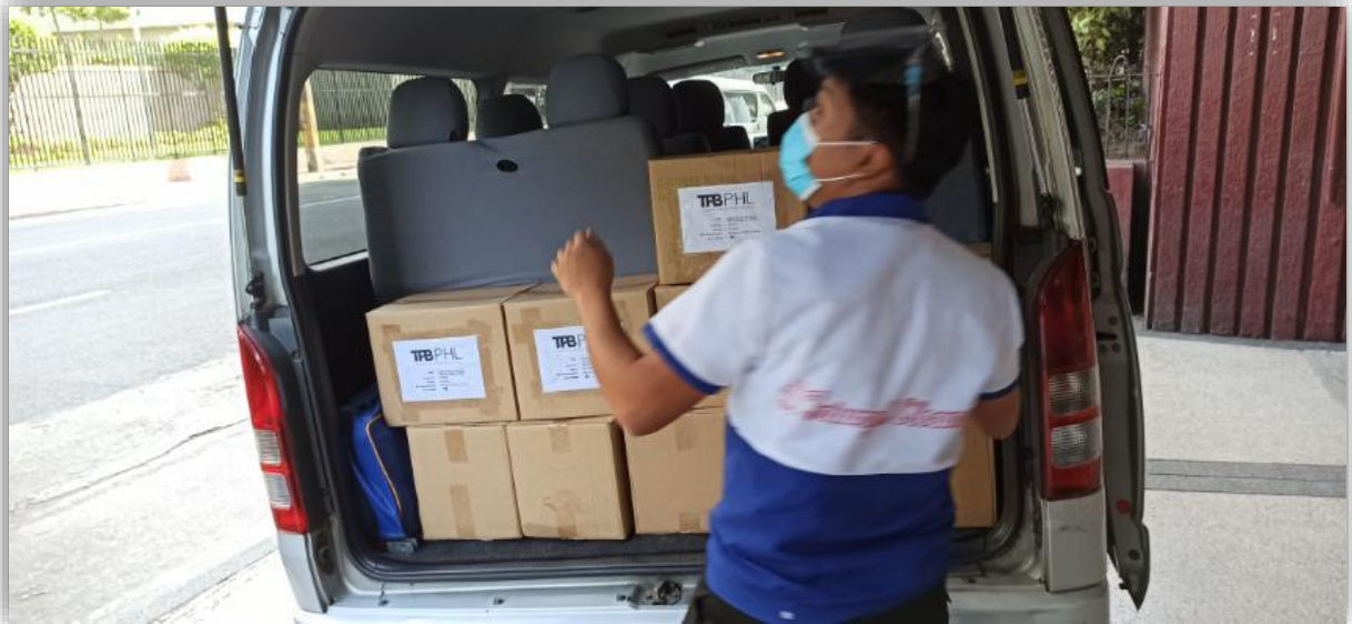
In Photos: Loading of the promo materials to TPB's vehicle for delivery to PGH