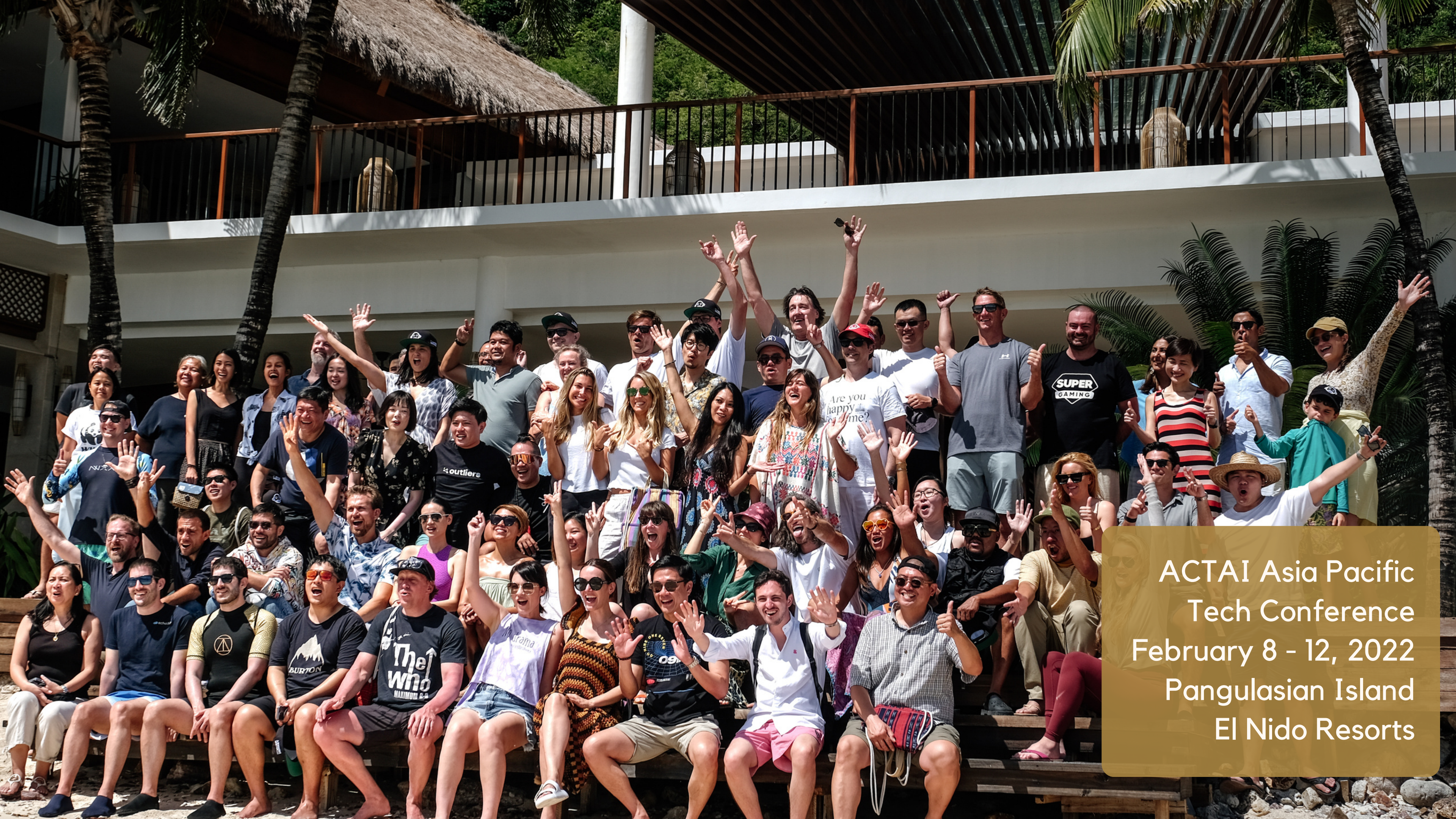
ACTAI Asia Pacific Tech Conference February 8 - 12, 2022 Pangulasian Island El Nido Resorts