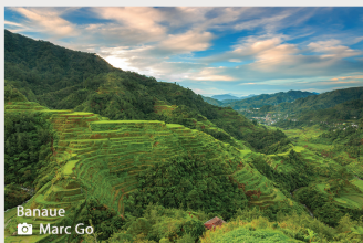
Banaue © Marc Go