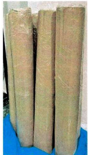
Item: Kraft Paper

Specifications: weaving strips of bamboo