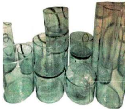
Item: Cylinder Glass

Specifications: fibers of the abaca plant