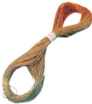
Item: Abaca String

Specifications: fibers of the abaca plant